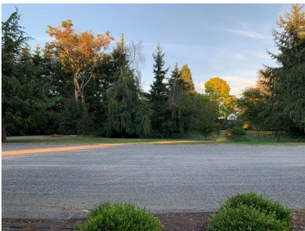
Before: Site of FHDG