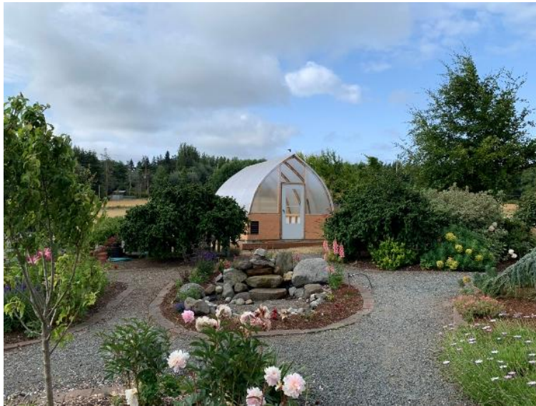
Greenhouse at Greenbank Farm