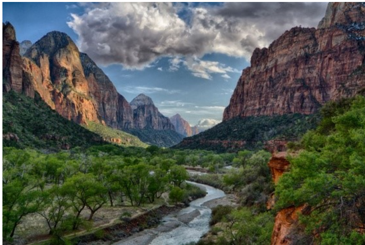
Zion National Park