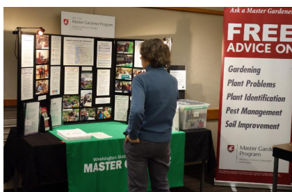
KCMG Display at the 2018 State Conference